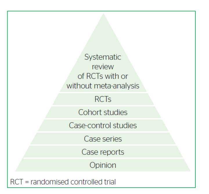
Figure 1. Hierarchy of clinical evidence (adapted from Akobeng, 2005<sup>6</sup>)

When making decisions about clinical interventions, it is common practice to consider the relative weight of the available research data, according to the type and quality of studies from which they originate. In this so-called hierarchy of clinical evidence (Figure 1), randomised controlled trials (RCTs) and systematic reviews are considered to be the 'gold standards' for judging the benefits of interventions.<sup>5,6</sup>